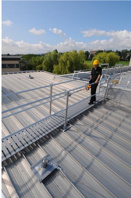
A typical cable system and walkway