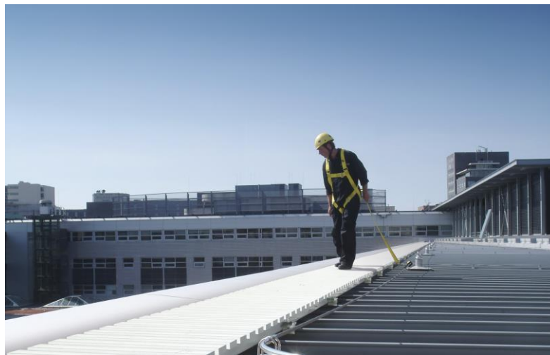
Collective fall protection of guardrail and walkway with accompanying cable system providing access to restricted areas