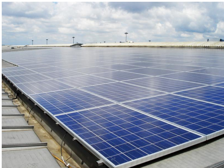
Example of a renewable technology system

With any type of roof there is more to placing renewable energy technology systems on the roof than meets the eye. Positioning photovoltaic panels to gain best power generation is one thing, keeping a fully functional roof is another matter.